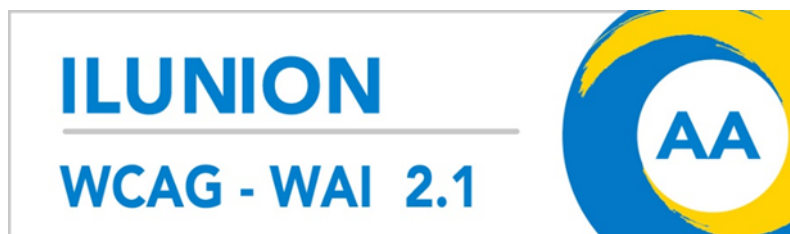
Figure 2. ILUNION WCAG 2.1 AA Seal.

The use of the ILUNION WCAG 2.1 AA certification is granted so that it may be included on your website, always respecting the content contained therein and without making any changes to its structure.